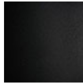
GFM73 black embossed