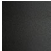
GFM69 graphite embossed